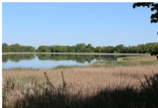
Rice Lake on a typical day in the spring

Under the heading of “Timing is Everything”, our nearby Rice Lake State Park, just east of Owatonna, might well be listed. Named for the small shallow lake that is considered the southeastern most natural lake in Minnesota, the park was created in 1963. The time was right to add some very important places into the growing list of parks to be preserved for their collective high-quality resources. In the case of Rice Lake State Park, there is a mix of natural resources including woods, wetlands, prairies, and the lake. This mix of features creates a wonderful place to protect a wide variety of plants and animals, and especially birds. The list of birds seen in the park includes over 230 species, an incredibly high number for a park of its size. Perhaps the most exciting times to see birds at Rice Lake are during the spring and fall migrations when the woods are likely to be alive with warblers, and the wetlands and lake are full of various waterfowl. Many species remain through the summer to nest in their favored habitat, so this is a good place to observe mating rituals and the raising of broods.