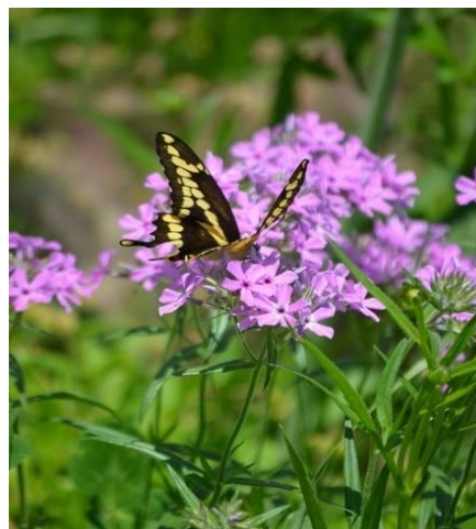
Swallow tail on Prairie Phlox

The preference is full or partial sun and moist to medium-dry conditions. It will tolerate a wide range of soils including those that are dry and rocky. Wet, heavy clays should be avoided. It is an excellent plant for gardens as well as naturalized settings. Its rhizomes spread slowly, its flowers are fragrant, and it has an exceptionally long bloom period lasting for 4 to 6 weeks beginning in late spring and lasting into early summer. Foliar disease doesn't bother this phlox to any significant extent. Most notably, it is resistant to powdery mildew which afflicts several of the taller phlox species.