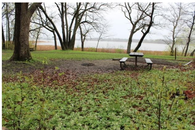
Trout Lily and Cut leaf Toothwort surround a lakeside walk-in campsite at Rice Lake Park.