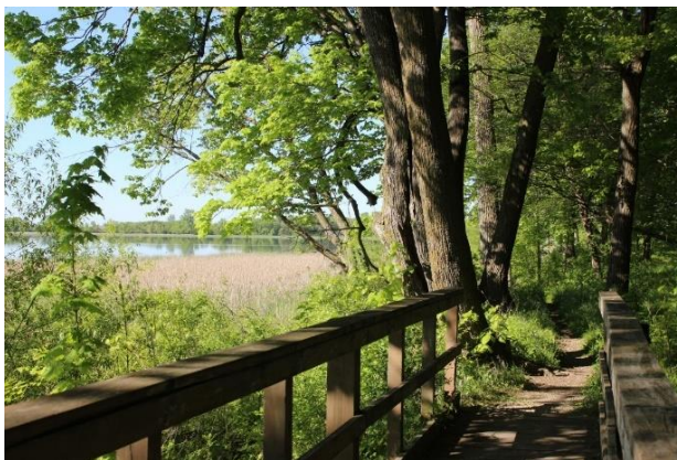
Woods and water along the Hiking Club Trail at Rice Lake

sandwiched between the vast prairies to the west and big woods to the east. Remnants of this past plant community are now exceedingly small, and Rice Lake State Park is an important example of this glorious past.