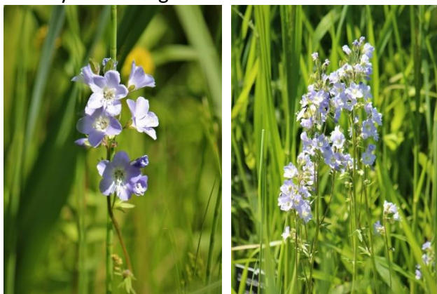
The Phantom Plant", the Western Jacob's Ladder.