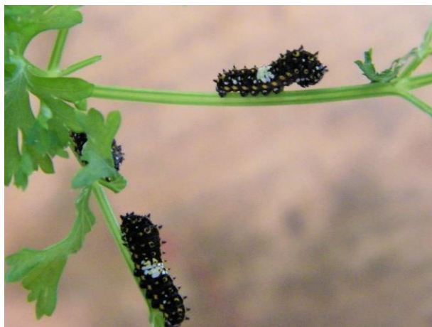
Black Swallow-tail caterpillars in Arlene's yard. After transforming her yard to a native plant oasis, Arlene noted many more species of wildlife in her yard.