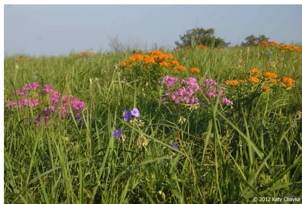
Prairie Phlox in a natural setting

The day I started this article I realized it was St Patrick's Day and I was reminded that it is one of my favorite times of the year. Not because I am Irish or because I like green beer – rather, because usually the greenhouse has been started giving me access to one of my “happy places” and, in most years, it is when I start seeing the first signs of life in the gardens.